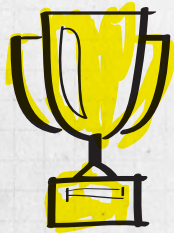
Best in Gallery Photo