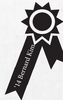
Best Story Photo Concession Prize