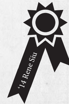
Best 'This is EMI' Photo Concession Prize