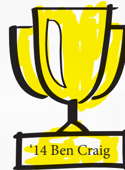
Magazine Cover Photo